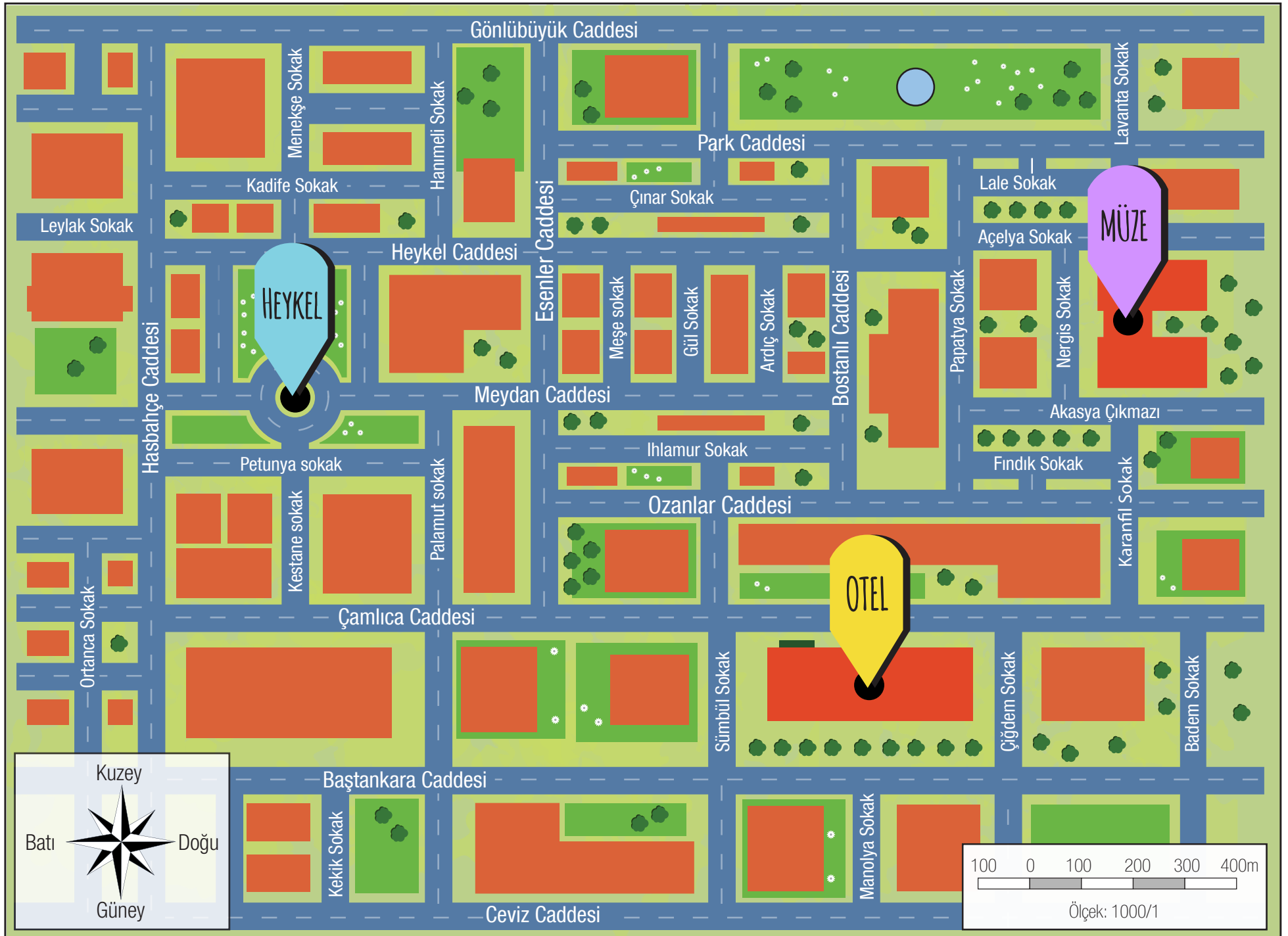
ADRES TARİFİ - HARİTA